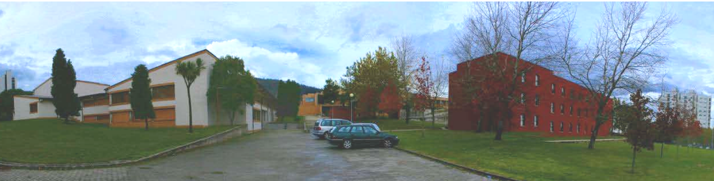
College of Education Viana do Castelo